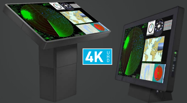
55" Chart / Tactical Table