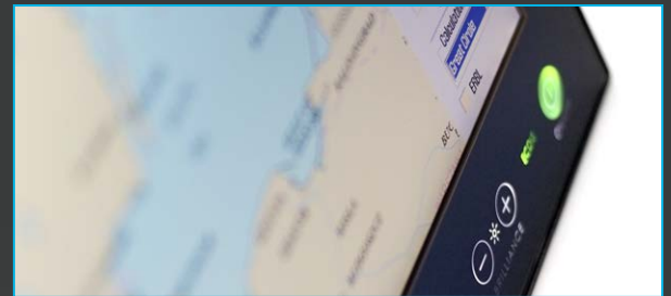
GLASS DISPLAY CONTROL™